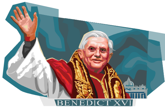
The Holy Father

VATICAN CITY—Are we not perhaps all afraid in some way? If we let Christ enter fully into our lives, if we open ourselves totally to him, are we not afraid that He might take something away from us? Are we not perhaps afraid to give up something significant, something unique, something that makes life so beautiful? Do we not then risk ending up diminished and deprived of our freedom? And once again the Pope said: No! If we let Christ into our lives, we lose nothing, nothing, absolutely nothing of what makes life free, beautiful and great. No!