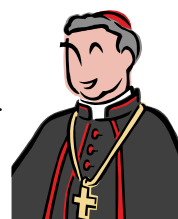
Bishops need prayers too!