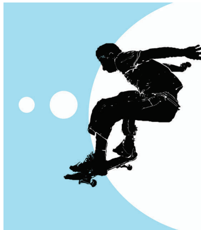
Youth Ministry taking off in Lycoming County

The plan is to focus on young men and women in grades 9 through 12. Activities will be centered on Spirituality, Socialization and